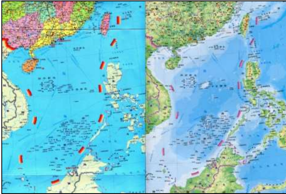
Figure 2. Overlapping Claims in the South China Sea and Adjacent Waters.

they also trigger efforts by the Indonesian state to strengthen presence, patrols, and cooperative mechanisms with regional partners.